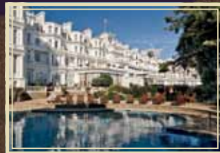
THE GRAND HOTEL

Tylney Hall is found sitting romantically in 66 acres of rolling Hampshire countryside. The palatial lounges and gourmet restaurant enjoy views of the tree lined vista, lake and formal gardens. Luxury and style greets you throughout the hotel and in the 112 bedrooms and suites, some of which contain four poster beds and spa baths. Indoor and outdoor pools, gymnasium and health spa complete the indulgent experience.